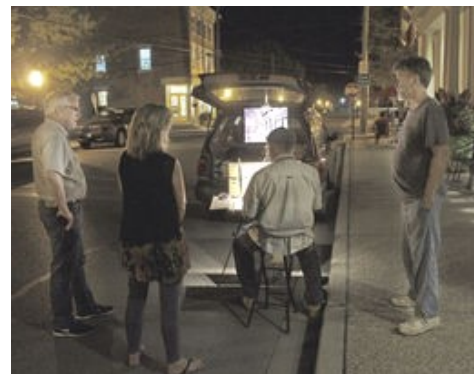
This night painting by Marty Coulter won the Best of Show at the 2017 Ste. Gen. Plein Air Event.

Artists begin turning in their paintings at Silver Sycamore for judging at 8pm.