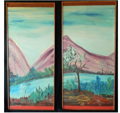
Depiction of the Italian countryside by homesick Prisoners of War.