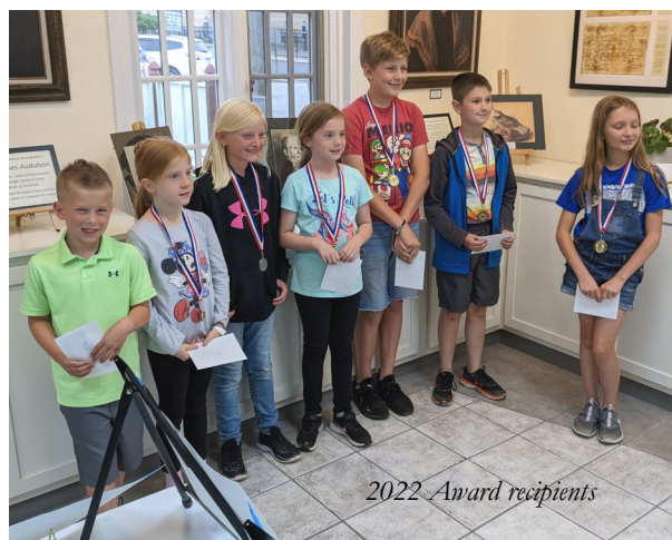
2022 Award recipients

A new category of very young artists ages 3 to 5 has been added to the Youth Plein Air Competition thanks to a $100 sponsorship from the GFWC Woman's Club of Ste. Genevieve. The Guild provides all supplies through the Arts & Education Council and funds the $50 Best of Show award. The prizes are also supported by individual members.