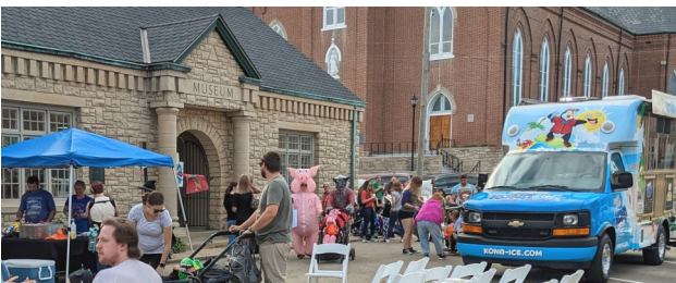
Call for Instructors