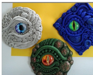
Dragon Eye and Exotic Bird

Tue & Thu Oct 26 and 28 Nov 2 and 4: 1-4pm Beginning Watercolor 3 hrs x 4 afternoons $25 with Iris Vincent Maximum 12 students We furnish all materials. Basic introduction to color mixing, application on various papers, care of brushes and fun experiments with color.