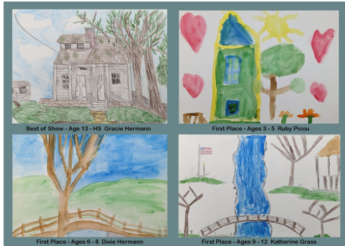
First Place awards in Spring Youth Plein Air.