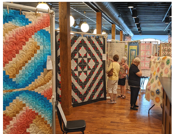
Each quilt's history was included on its label.

Held on Jour de Fete weekend, our first-ever Quilt Show & Sale was our largest-ever event both in terms of visitors and size of exhibit. The spacious DuBourg Centre banquet facility was filled wall to wall with 134 creations from local quilters. Most were heirlooms not for sale. It took 30 Guild volunteers, Parish Quilters and the Valle H.S. Girls Volleyball team to make it happen. Funded by donations and a grant by SG County Community Fund.