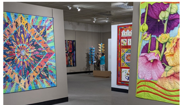
Getting lost in stitched art at the National Quilt Museum.