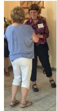
Audubon’s gift certificate from the Guild. Thanks!