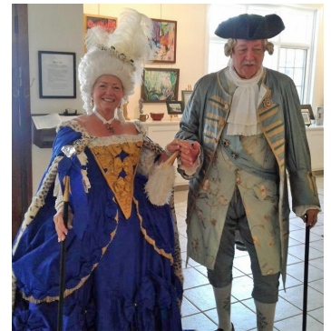
Marie Antoinette and King Louis XVI added a royal presence ahead of Festival duties - and cooled off.